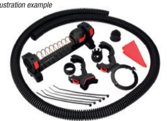
Abb. beispielhaft Illustration example