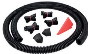
Abb. beispielhaft Illustration example