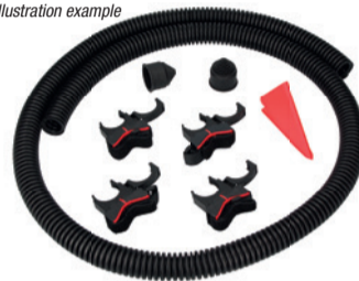
Abb. beispielhaft Illustration example