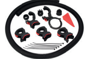
Abb. beispielhaft Illustration example