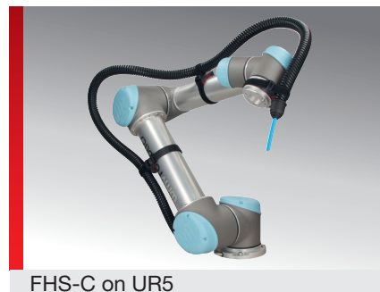
FHS-C on UR5