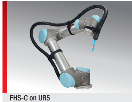
FHS-C on UR5